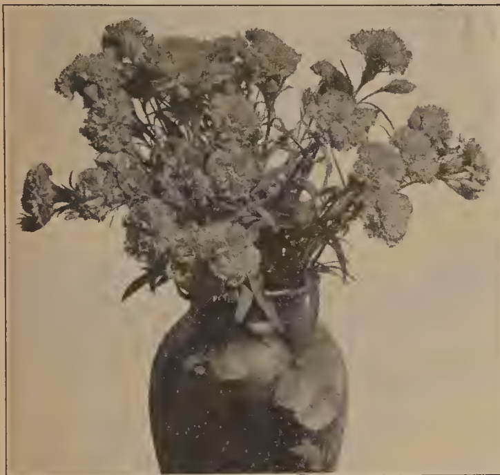
Improved Crimson King

We are pleased to offer herewith several very outstanding new plant introductions which will meet with popular demand in 1937. The popularity of these plants is now well established; every florist will profit by offering these introductions to his trade.